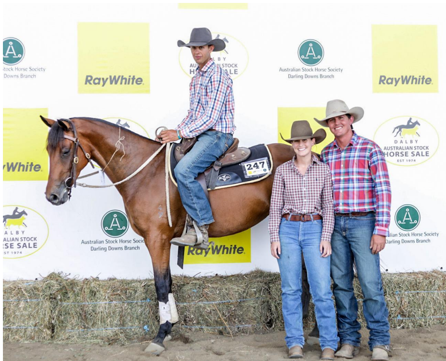
Penwood Creations: Top priced mare, Lot 247 - Bellvue Sumacon.

As well as the $95,000 sale, one mare also sold for $90,000, and several others achieved over $40,000.